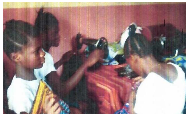
Cutting and sewing course

The two-year training culminates in the granting of a patent and the award of a sewing machine to the laureates. The acquisition of this machine will allow them to open a workshop, have a professional activity and take charge of themselves.