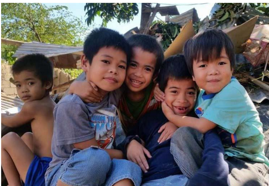
Each year, the proceeds from a Bridge Tournament go to children in the Philippines.

F acing this unprecedented health crisis which is still going on, UFASC had to mobilize and follow the recommendations of the public authorities.