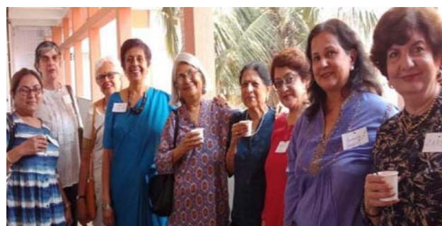
Coffee and cake 2019