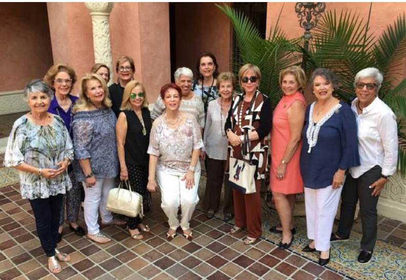
« Mater Day » at Carrollton on october 2017 with alumni of Puerto Rico

T he planned activities for the month of March, our Day of Reflection, Mater's Feast in May, and our "Hojas de Otono Reunion" where generally about 200 alumnae attend were cancelled due to the pandemic.