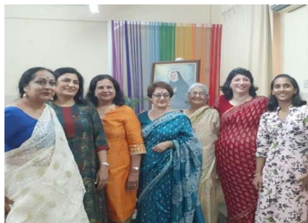
Annual General Meeting 2019